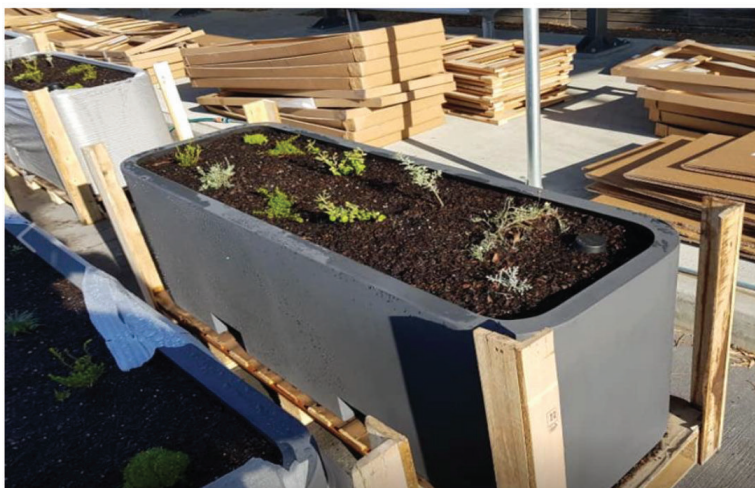
Installed in March 2020

The following images show the construction and growth of the planters outside Hobart Airport, Australia's driest state capital city.