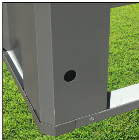
Figure 1. This image shows the end section with the hole for the overflow pipe.