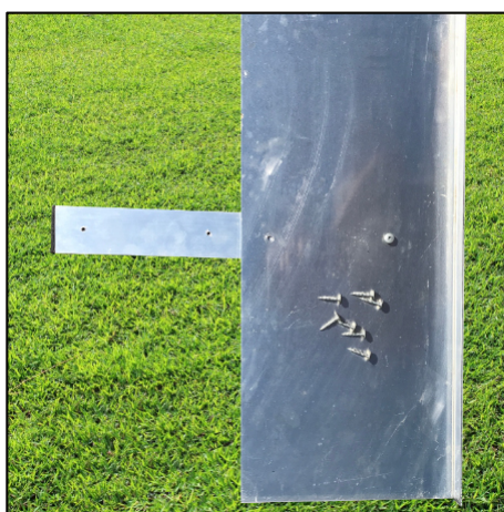
Figure 3. Screw the 2 x 1130mm long flat aluminium sheets to the 2 square planter base 'feet'.