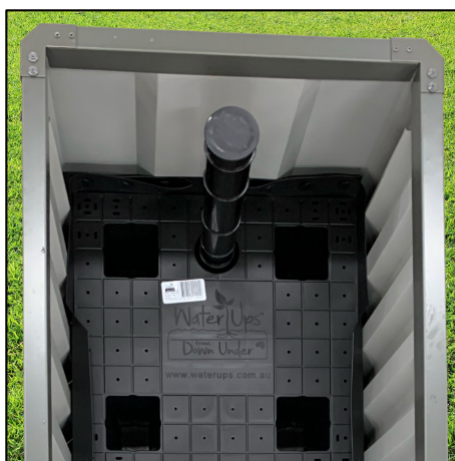
Figure 4. The bed is now complete. The only thing remaining is to fill the feet of the WaterUps® cells with perlite, then add the potting mix, compost and plants, and fill the reservoir with water.