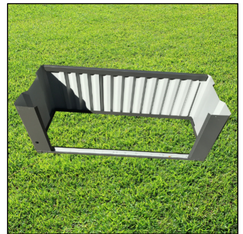
Figure 2. The front wall panels and the top rails need to be added to complete the walls of the Oasis 1240 wicking bed.